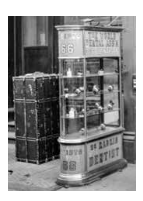
"A Living Sign on Fifth Avenue." Franklin's Dental Parlor, New York City, 1905.

Twenty years later, the ODA's Code of Conduct, would ban its members from using showcases to attract clients.